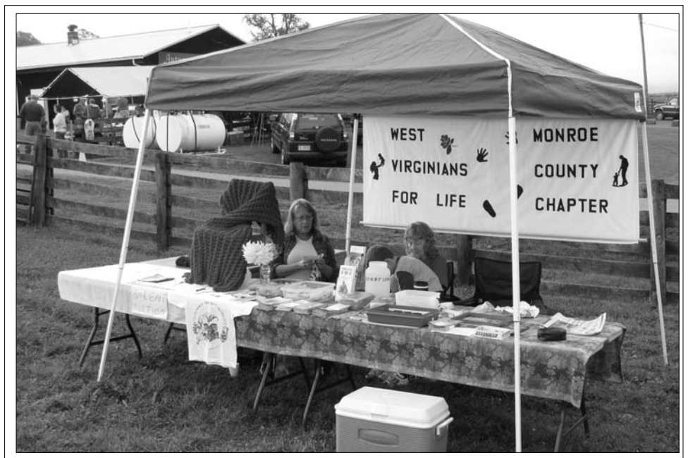
The Monroe County Chapter held a silent auction at this booth and raised funds from the highest bidder on a crocheted afghan.

Upshur: Upshur County Right to Life held a raffle recently to help pay for their billboards. At the September meeting a drawing was held for the three baskets of prizes and gift certificates.