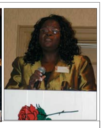
Lord's Prayer beautifully.