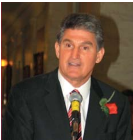
U.S. Senator Joe Manchin III