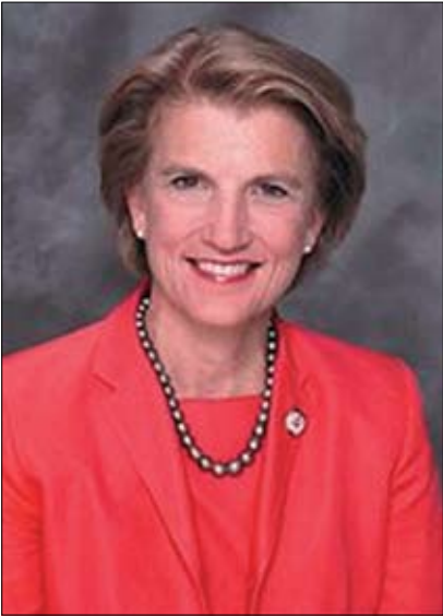
2nd District Congresswoman Shelly Moore Capito

The 2011 Legislative Session begins January 12.