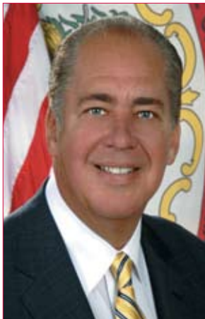
Governor Earl Ray Tomblin

West Virginians for Life congratulates all pro-life winners on their victories, as well as the grass roots people who worked diligently for their pro-life candidates. We look forward to working with all of you in 2011!