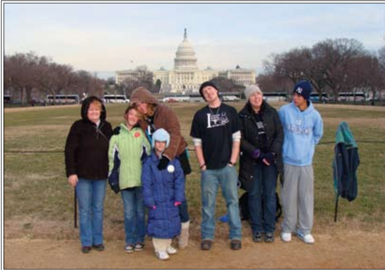
Raleigh and Fayette County chapter members desire to go back to D.C. for the March in 2011.

the bane of our American experience. Make your public stand. Donations to the ad can be made payable and sent to: WVFL-Mon County Chapter, PO Box 1479, Morgantown, WV 26507-1479. Any amount is acceptable. Be sure to include how you want your name to appear in the ad.