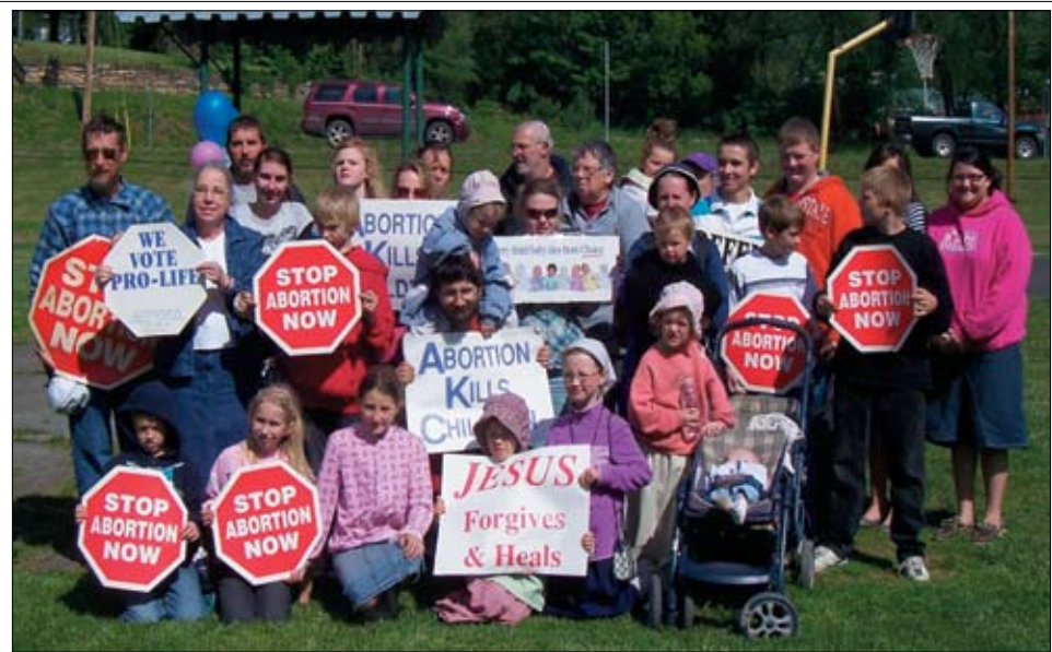
Mineral County walkers in the May 8 Mother’s Day Walk-for-Life