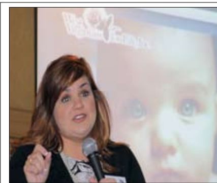
Former Texas Planned Parenthood Director Abby Johnson making a point to the pro-life faithful.