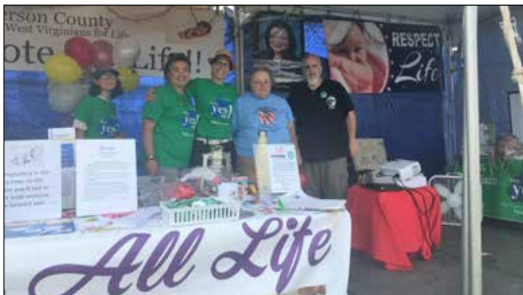
Pro-Life booth at the Jefferson County Fair