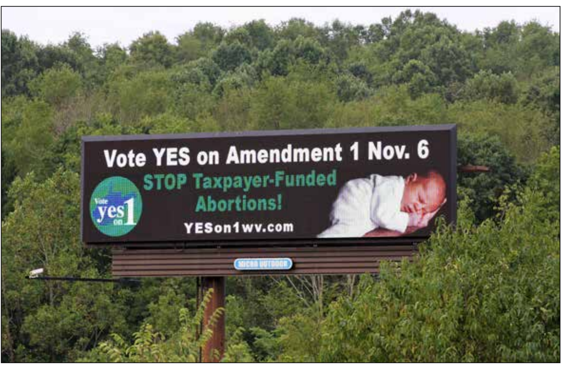
One of Two Vote YES on Amendment 1 Billboards in Morgantown