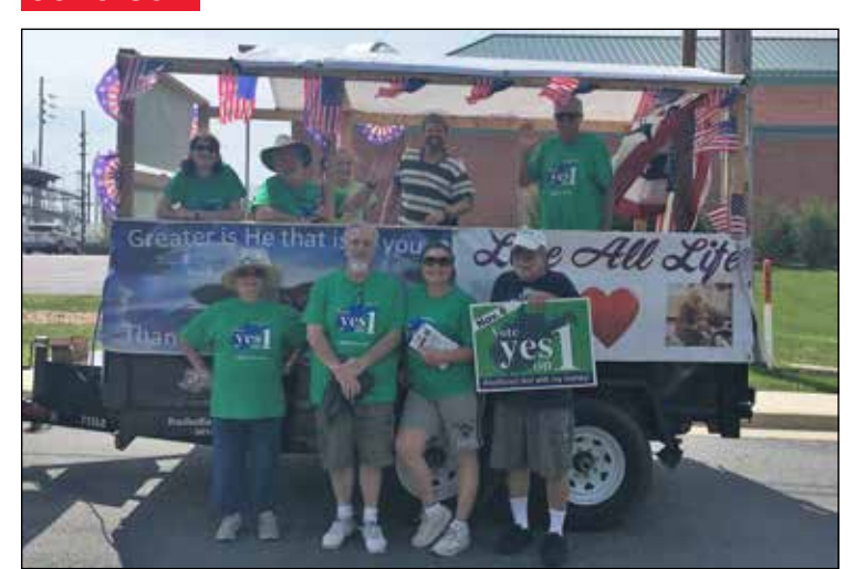
Above and below: Chapter float in African American Heritage Parade