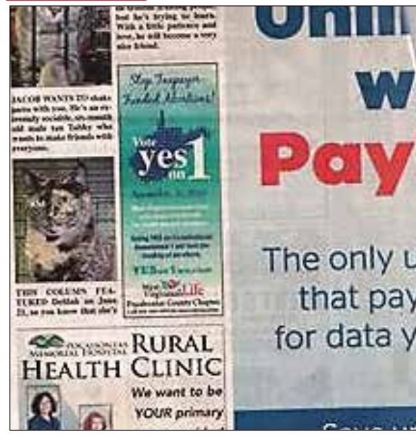
Kudos to the Pocahontas County Chapter for running this Yes on 1 ad in the local newspaper every week until November.