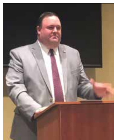
Seven staffers, left and below, from the offices of Senators Shelley Capito and Joe Manchin as well as aides from Representatives David McKinley, Alex Mooney and Carol Miller addressed the crowd and entertained questions.