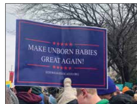
The signs are always the best at the March for Life.