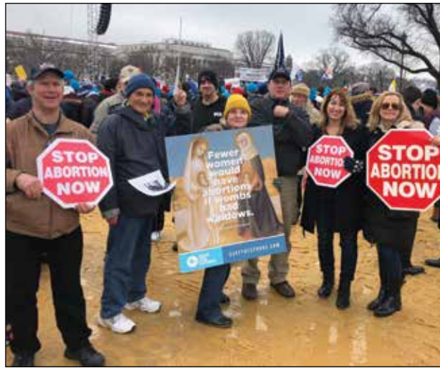
Though muddy, this group enjoyed the mild January temperatures that the day provided.