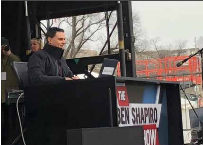
Millennials (and others) hung on every word uttered by The Daily Wire's Ben Shapiro.