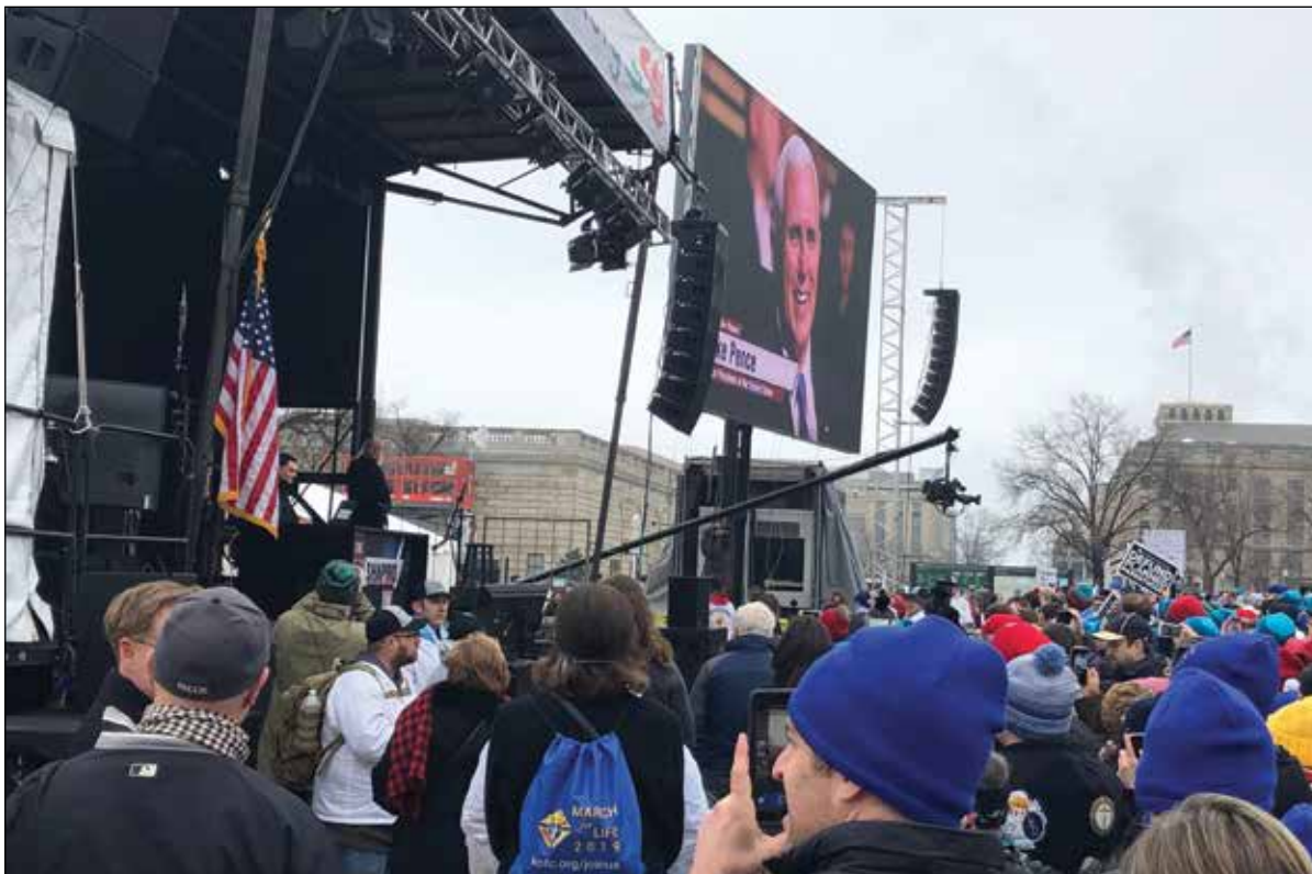
Vice President Mike Pence and wife Karen spoke at the Rally and introduced a President Trump video.