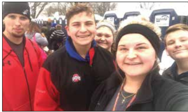
Teens in Mason County got to attend the March for Life on January 18 for the 4th consecutive time and, as always, enjoyed being there to represent their generation.