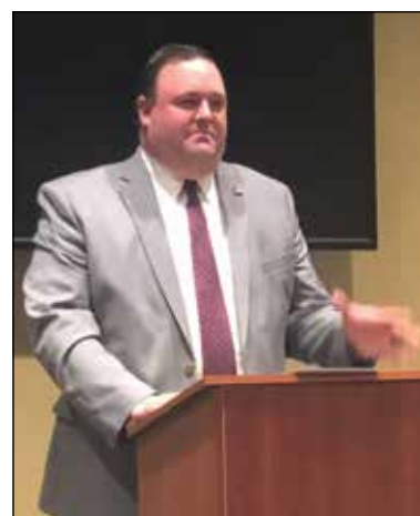
Seven staffers, left and below, from the offices of Senators Shelley Capito and Joe Manchin as well as aides from Representatives David McKinley, Alex Mooney and Carol Miller addressed the crowd and entertained questions.