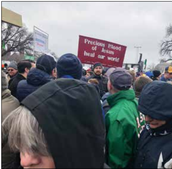
Another example of awesome signage