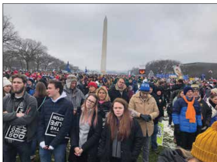
Crowd shot looking toward the Washington Monument. Estimates of 600,000 marchers were reported.