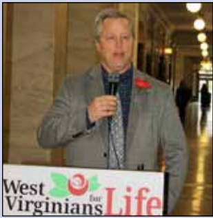
The lead sponsor of SB 436, the Non-Discrimination in Involuntary Denial of Treatment Act, Sen. Robert Karnes also mentioned SJR 12 at the mic.