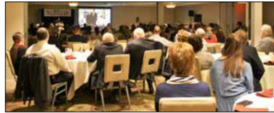
The venue was packed.