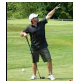
One member of the Christian Golf Association of Upshur County goofing off