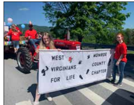
Farmer's Day Parade Entry above and below