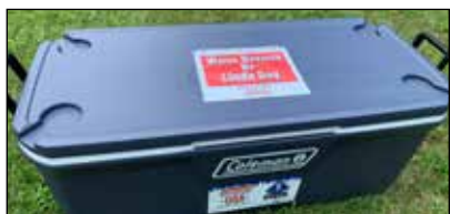
Cannot thank Linda Day enough for the 480 bottles of water!