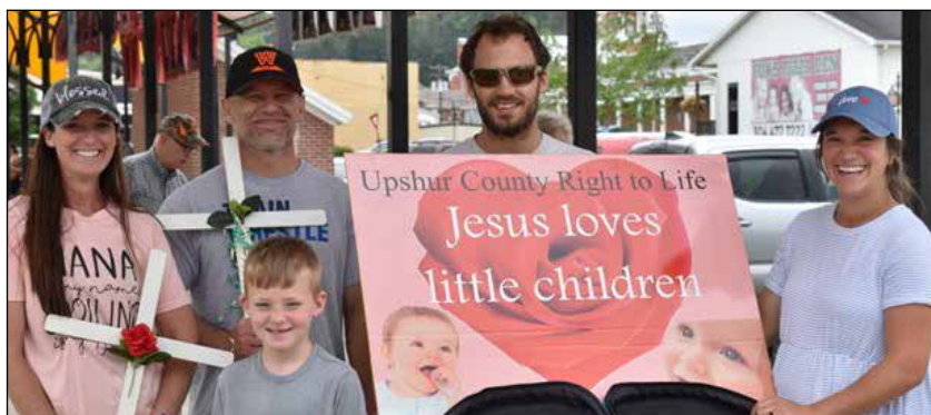
The Upshur County Chapter held a highly visible Walk-for-Life on June 26. The local paper gave great coverage!