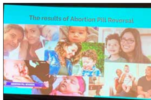
Opponents of abortion pill reversal kept saying there was no evidence that the procedure works. This slide shows a few of the 2,000 successful results.