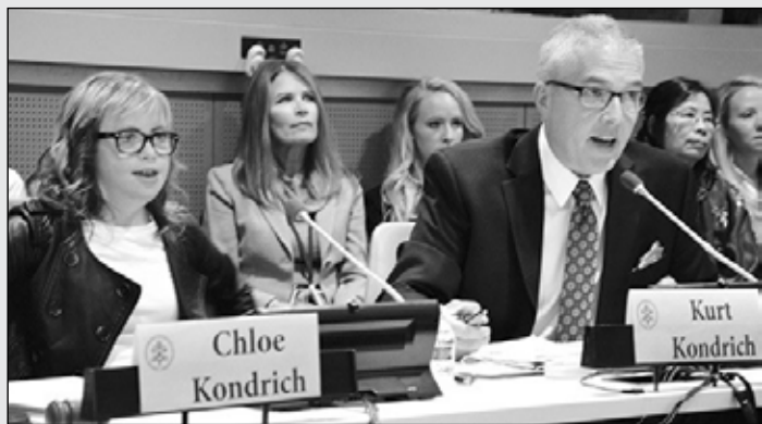
Father and daughter testifying at the United Nations in 2018

Don't miss the convention. The registration form is on page 9.