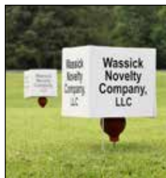
WVFL appreciates Wessick Novelty Company's Gold Sponsorship this year.