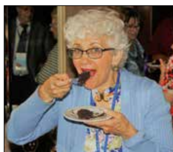
A "50th Anniversary" cake to celebrate 50 years of the National Right to Life Committee was served up to all after the 8-10 p.m. General Session on Thursday.