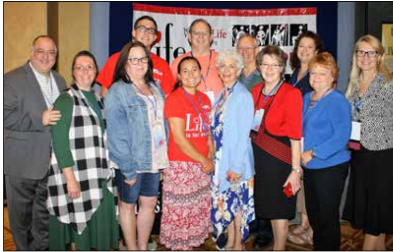
The West Virginia contingent posed in front of the #wv4life exhibitor table. Four WVFL Chapters are represented here.