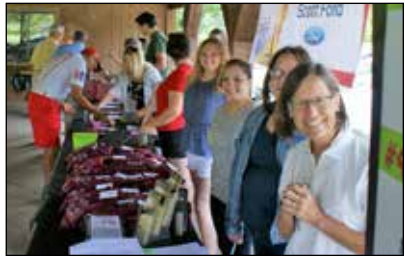
The importance of good volunteers (all 22 of them) cannot be overstated.