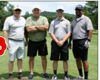
Appalachian Pest Control scored an identical Third Place 59, but a tie-breaker dropped them to Fourth Place. They were the 2020 winners.