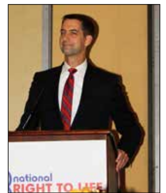
Sen. Tom Cotton of Arkansas gave the Closing Banquet keynote address to conclude the 2-day event. The topic was "Making Respect for Life a Daily Occurrence."