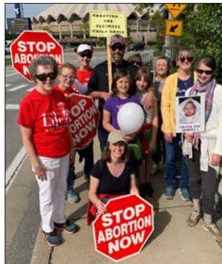
The chapter hopes to get back to holding the annual Walk-for-Life in the spring. This one was September 25.