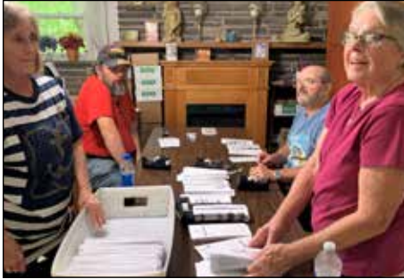
Nothing like volunteers from Doddridge to help with a mailing.