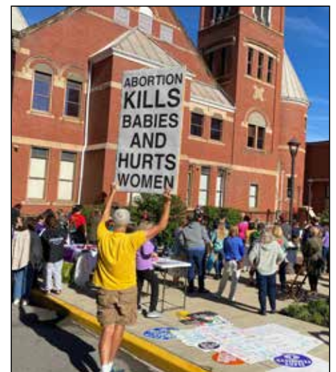
Counter-protest by the Mon County Chapter at the "Rally for Abortion Justice" on the Mon County Courthouse Square in Morgantown