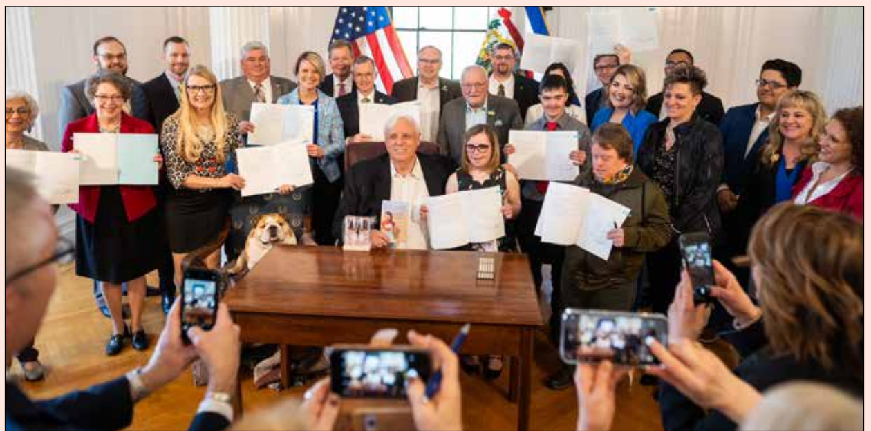
The whole group joyously held up copies of the bill.