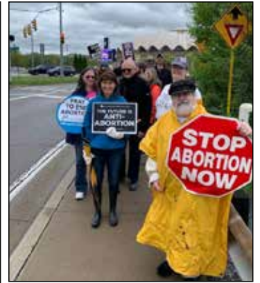
Turning around at the WVU Coliseum to head back to pavilion on the 3.4 mile course