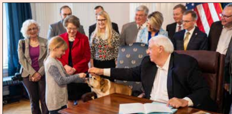
Baby Dog certainly was a big hit.