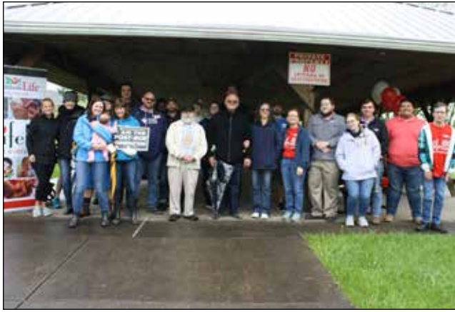
Whole group photographed at the outdoor pavilion at St. Mary's in Star City