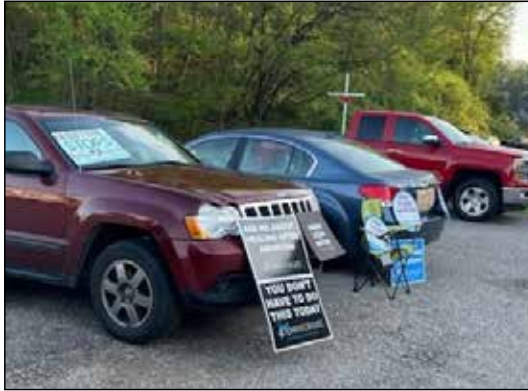
Signage present at the LifeSiteNews filming is frequently seen on God's Property.