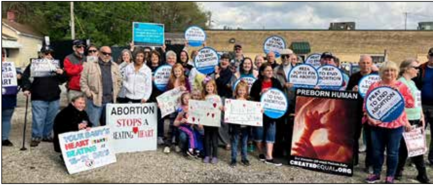
LifeSiteNews visited the God's Battlefield site in late April to do a story. Many supporters turned out for the story and filming. Visit lifesitenews.com and search for "Miracle in West Virginia."