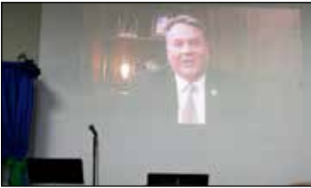
C3 Congressman Alex Mooney on video