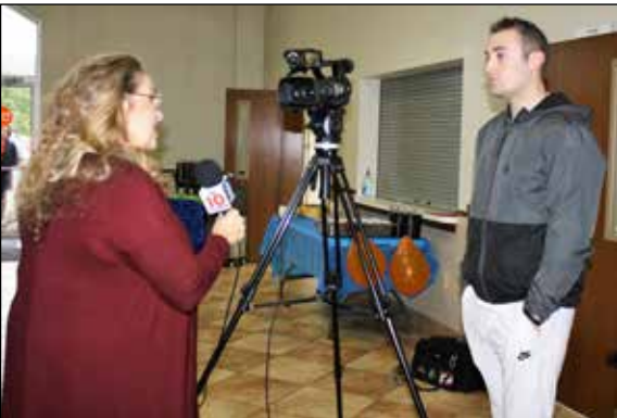
Ganz - WDTV Interview