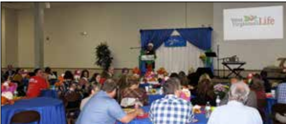
Numerous Door Prizes won