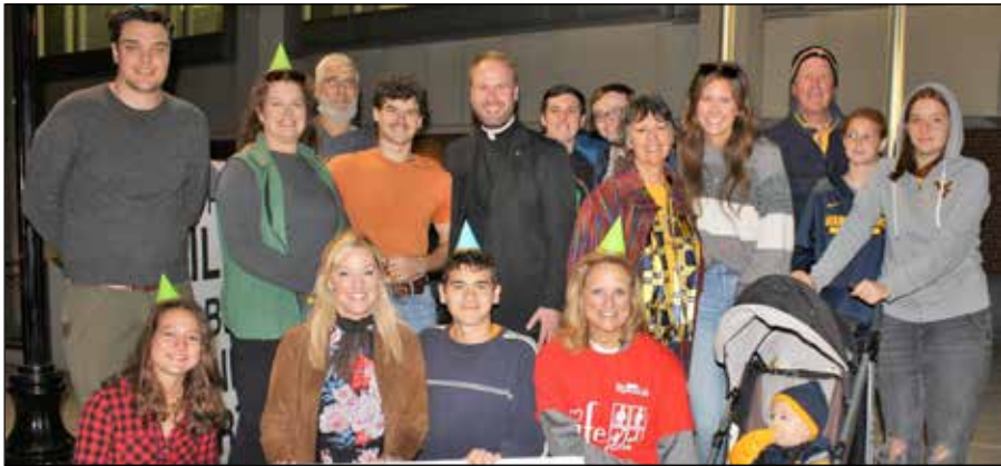
WVU Homecoming Parade