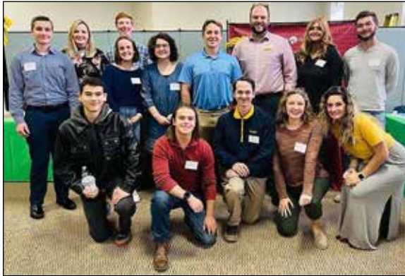
College Students from 3 different campuses