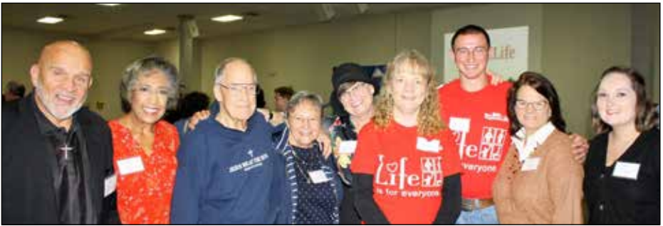
Kanawha County Chapter