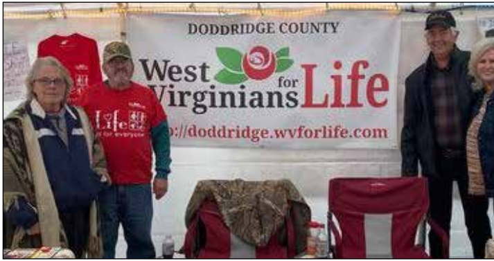
The Northrops and Allens