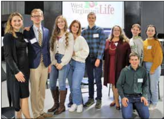
Teen Day Camp