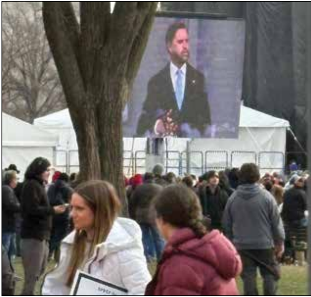
Vice President Vance addressing March for Life attendees