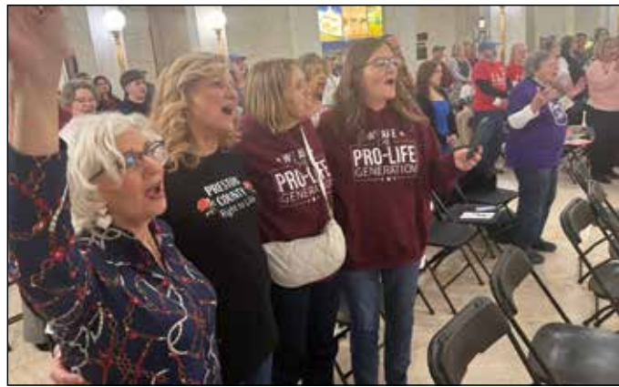
Rally Quartet singing God Bless America