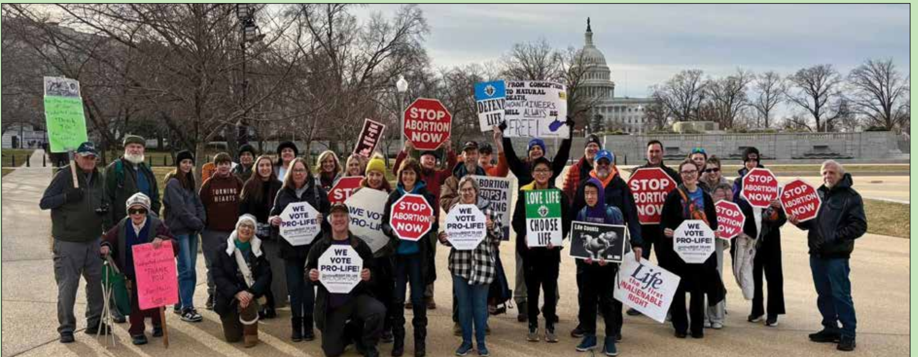
West Virginians for Life at the March for Life in Washington, D.C.