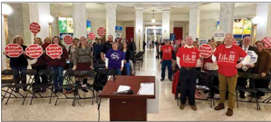
Rally Attendees in the Lower Rotunda of the Capitol