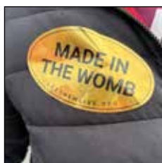
Neat sticker on someone's coat