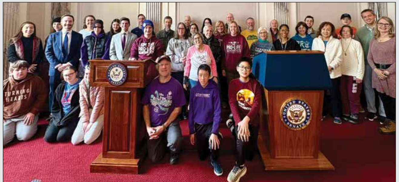
March for Life attendees from West Virginia in Russell Senate Office Building with staffers