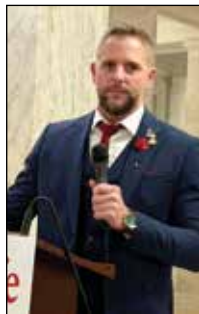
Sen. Craig Hart