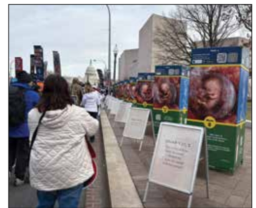
This fetal development display was wonderful!