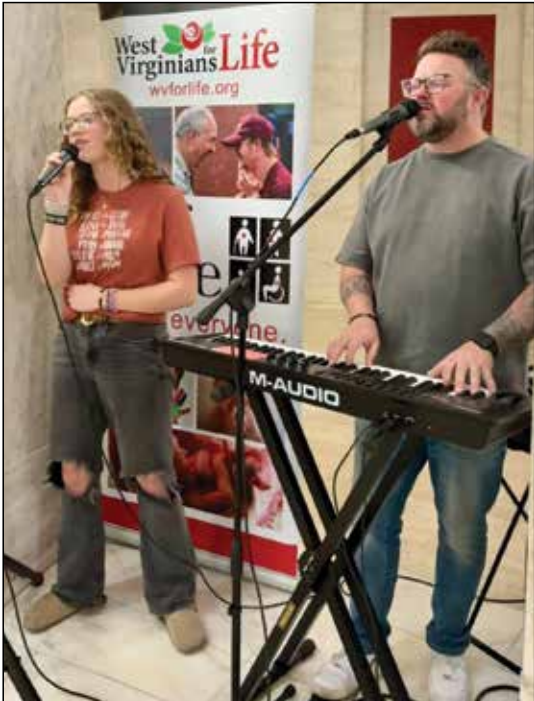
The McCutcheon musicians were greatly appreciated.